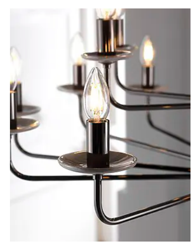
©Innovative Design Studio by IDG ©Innovative Design Studio by IDG ©Innovative Design Studio